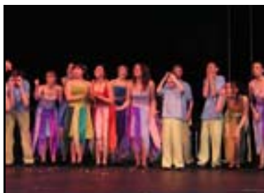
The company from The Hare and The Hedgehog

This was Youth theatre at its best and with such fine actors as these the future looks bright for the Lacemarket.