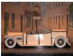
Car on stage

The storytellers of Nottingham 01159558054 or teapottwins@aol.com