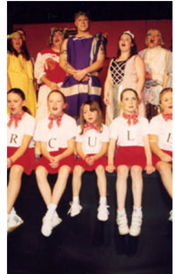
The finale from 'Hercules'

The next deadline date for publishing is 20th March 2004.