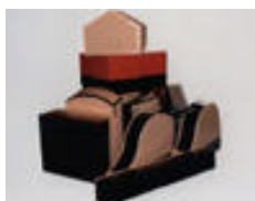
Car as luggage