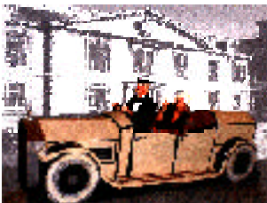
Computer ad to sell the car